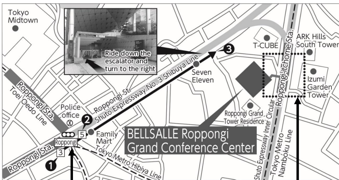
Access from Roppongi Sta.